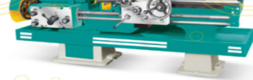
HEAVY DUTY PRECISION LATHE MACHINE UPTO 205MM