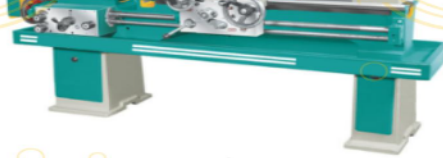
MEDIUM DUTY PRECISION LATHE MACHINE UPTO 80MM